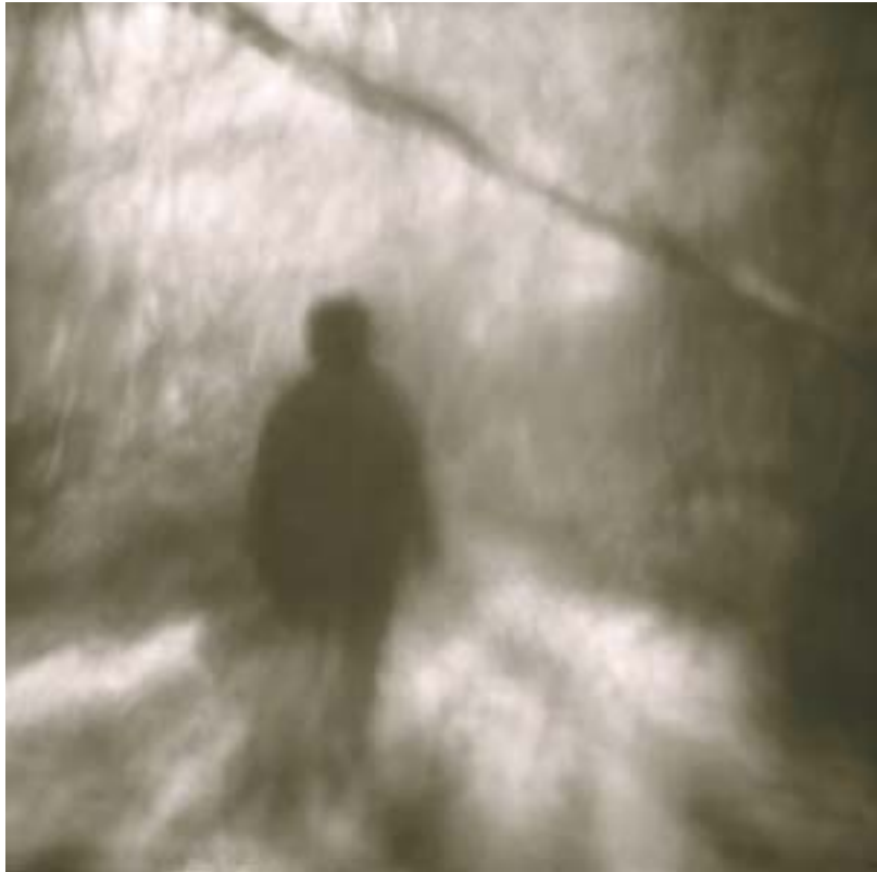
“from...to” Series #2, 1993/94

Victoria Donohoe, The Philadelphia Inquirer