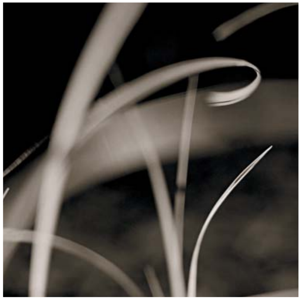
Forest Light Series #11, 1992