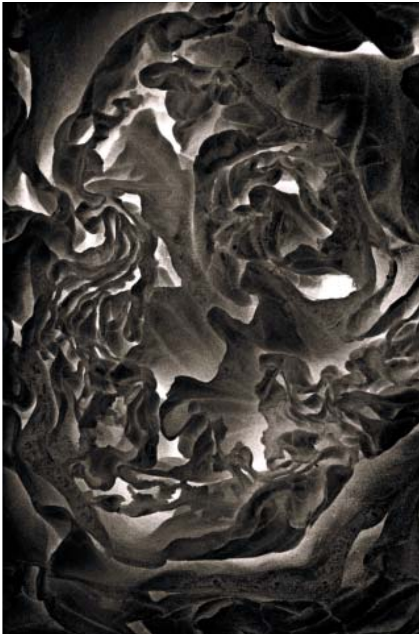
Life Forms Series #16, 1986