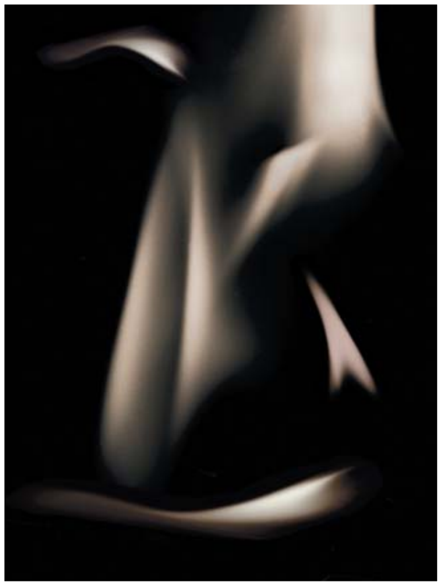
Fire Music Series #2, 2004