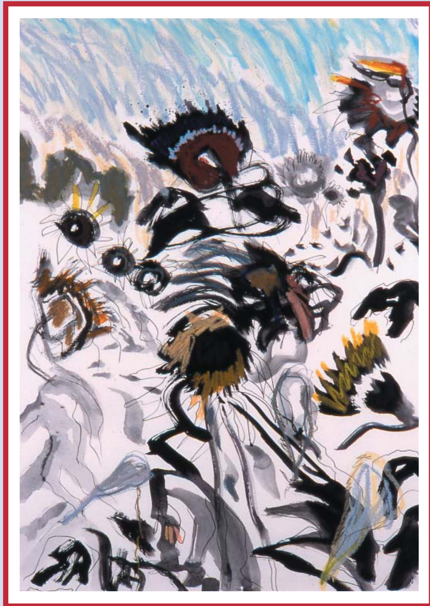
Sunflowers Near the Meeting, mixed media on bristol, 20 x 14, Helen Mirkil.