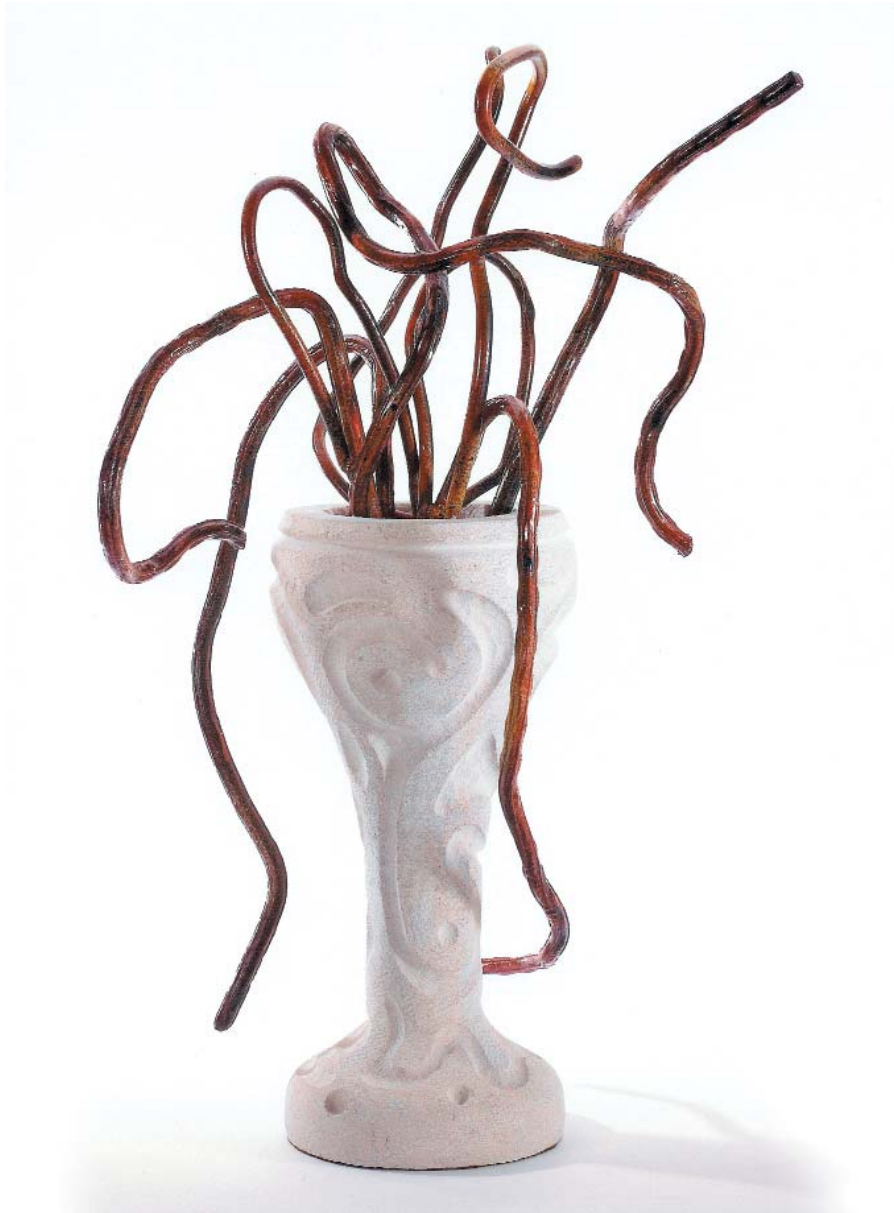
Foaming cup, 30 x 14 x 14, David Day.