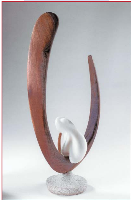
left. Unformed substance, 24 x14, David Day.